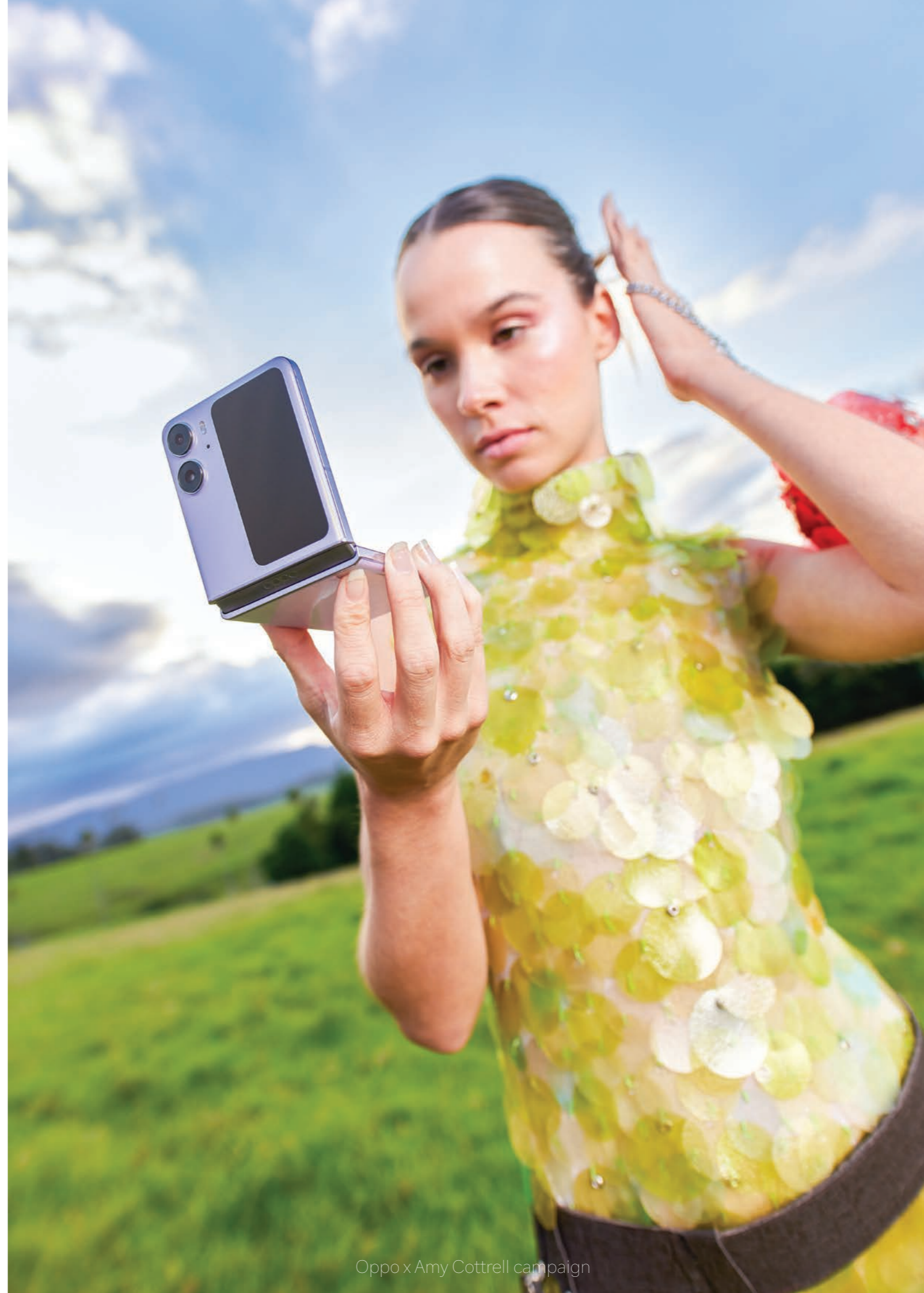
'Plasticity' Collection as featured in Melbourne Fashion Festival 2023 National Graduate Showcase