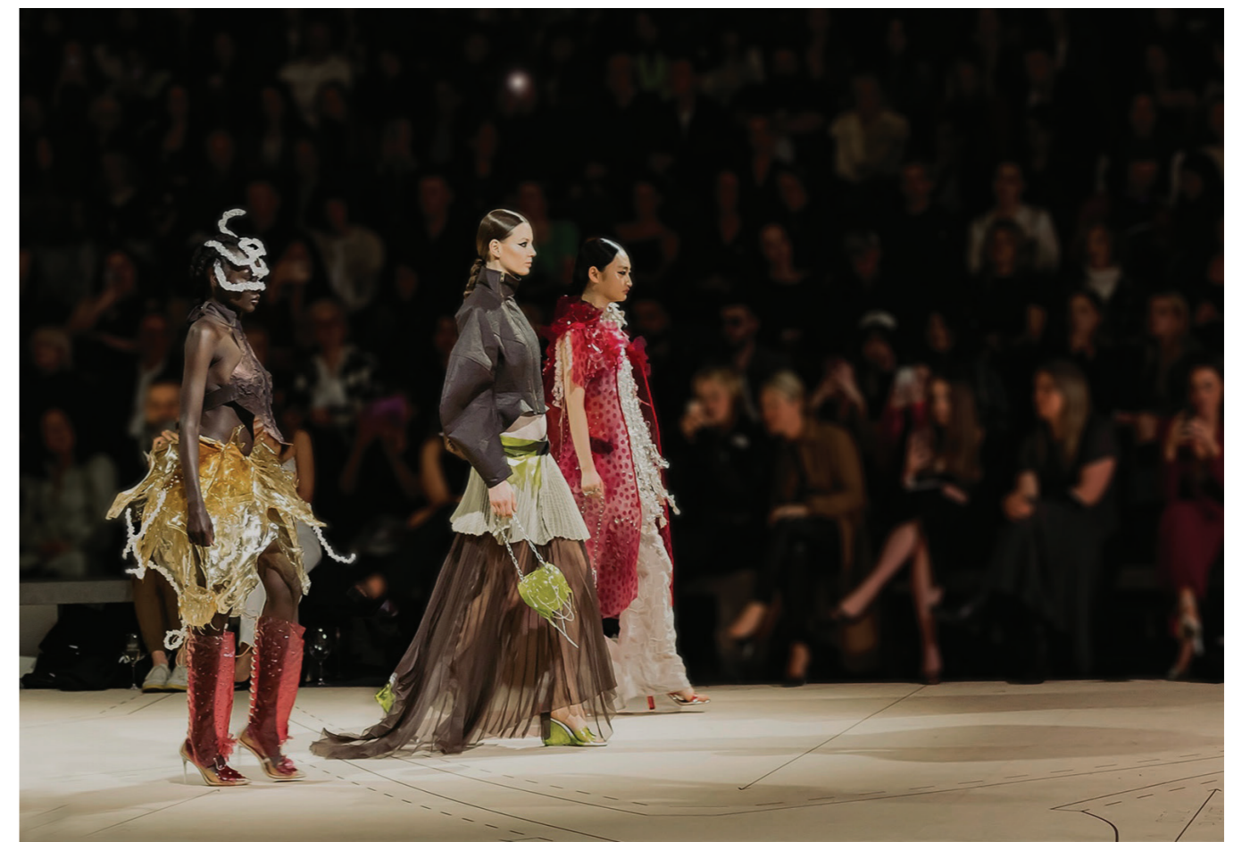
'Plasticity' Graduate Collection as featured in Melbourne Fashion Week Student Runway 2022