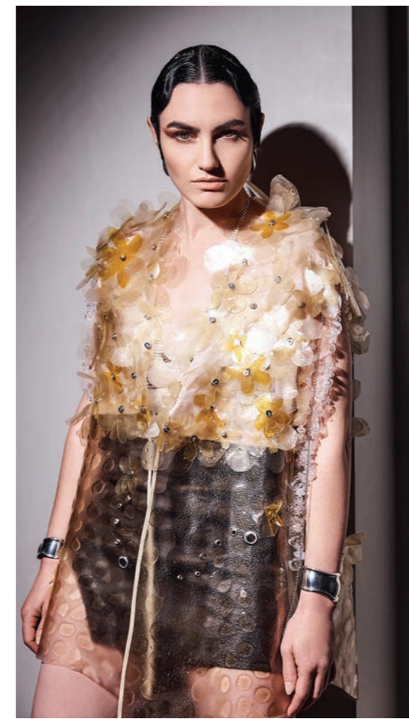
Stella Magazine editorial