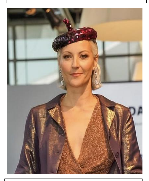
MF/W 2022 Bella Management Catwalk Show