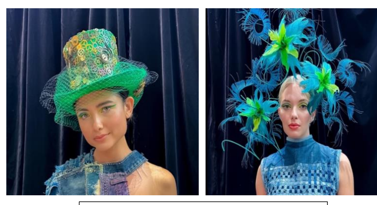
2022 Box Hill TAFE Fashion Design Students end of year runway show