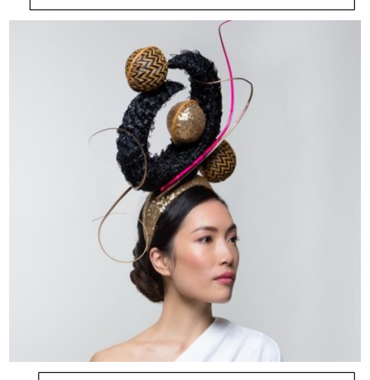
2022 Millinery Australia Members Millinery Award Theme: Counterbalance