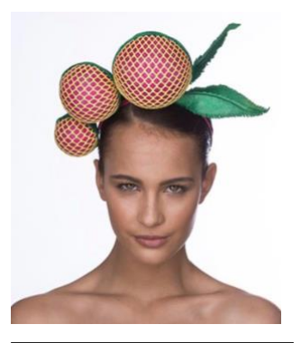
2019 Millinery Australia Members Millinery Award Theme: Cocktail