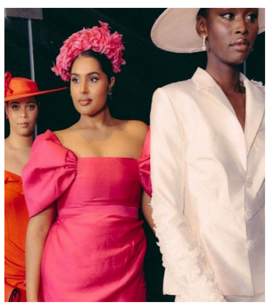
2023 Flemington VRC Melbourne Cup Carnival Spring Gala Runway - Melbourne