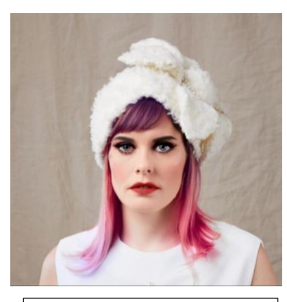
2022 MIMC Millinery Competition Theme: Derby Day 1963