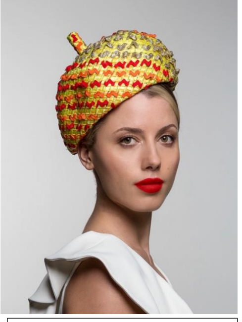
2023 Millinery Australia Members Millinery Award Theme: Ruffled