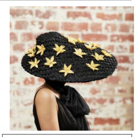
2022 MIMC Millinery Competition Top 10 finalist Theme: Little Black Dress