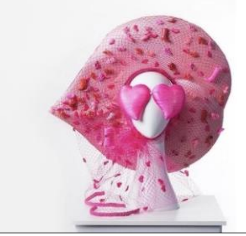
2021 MF/W "Boldly Different" lockdown showcase of Melb arts during lockdown 2021 Curated Display at Joel Gallery by Millinery Australia 2022 featured in showcased static display at Melbourne Town Hall