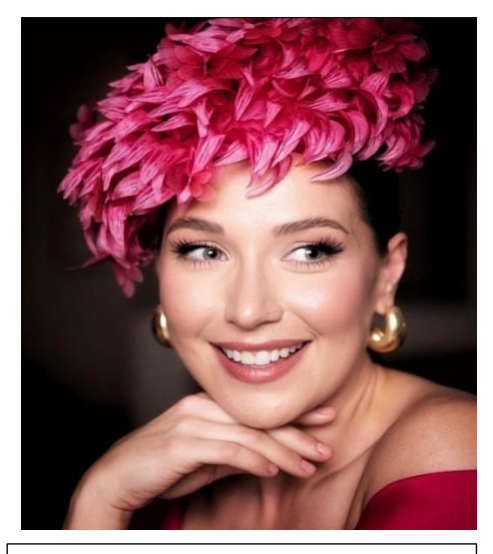
2023 Flemington VRC Melbourne Cup Carnival – Sydney Showcase