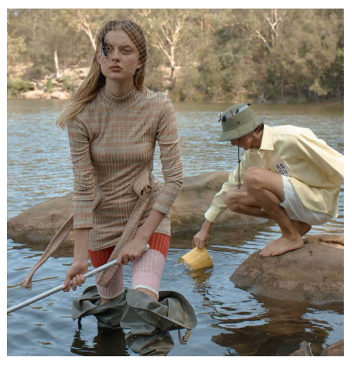
THE PERFECT CATCH